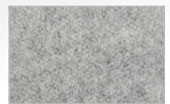
61 - Silver Hook & Loop