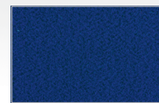
59 - Royal Blue Hook & Loop