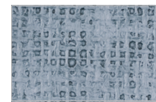
47 - Pacific Blue Vinyl