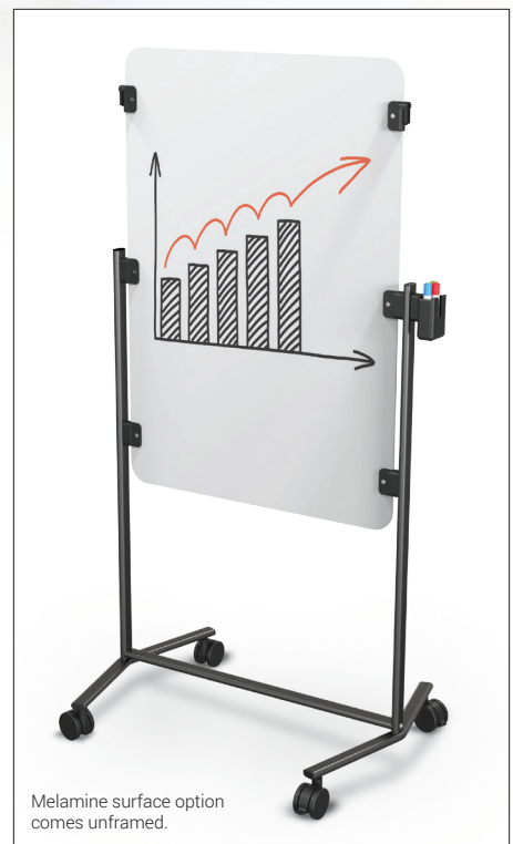
Melamine surface option comes unframed.